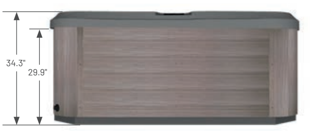
Front/Back View Tolerance ± 0.5" (1.27cm)