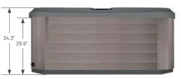
Front/Back View Tolerance ± 0.5" (1.27cm)