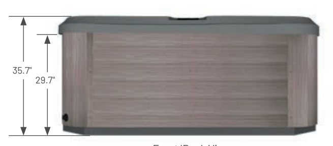
Front/Back View Tolerance ± 0.5" (1.27cm)

The Gecko electrical control pack is situated under the Keypad